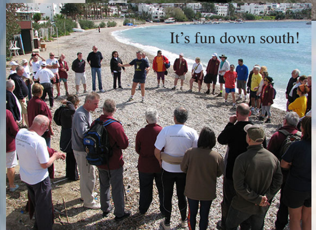
It's fun down south!