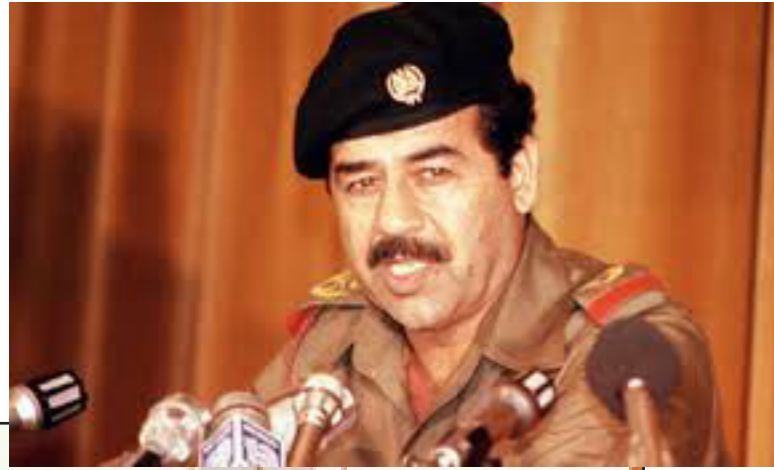
Baghdad Run Number 1