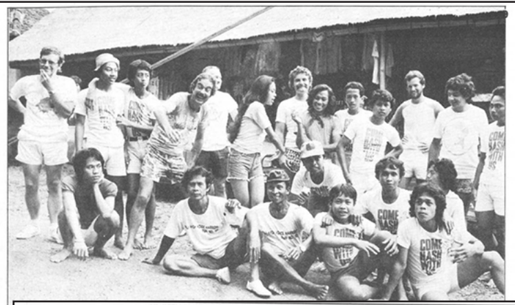
INTERHASH '86 PATTAYA THAILAND

Being an acclaimed author, it was quite a natural progression for Victor to write a book about the Bali