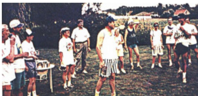
Blimy in his younger days

In 2003 Bloating Bladder proposed to The Dyke on a hash coach. The following day Athens H3 held an engagement ceremony in the Circle on the beach at Pefki